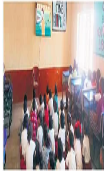
Schools bring missing kids back to classroom