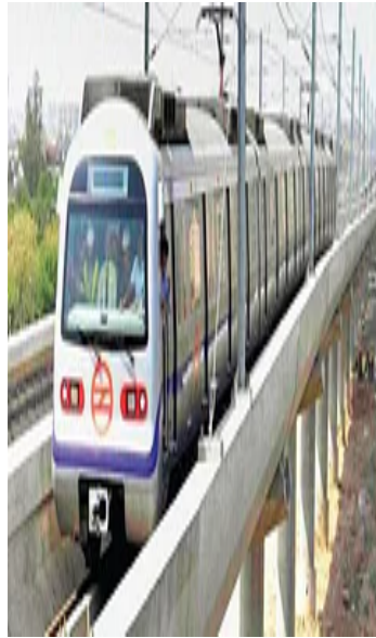
Interchange hub at blue line to ease travel