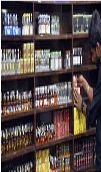
Club owners hope for revival with new timings