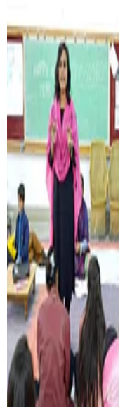
Un-tying t save girls

Now we are on Telegram too. Follow us for updates